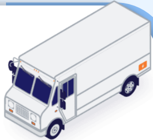
Step & Panel Van