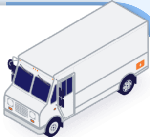
Step & Panel Van