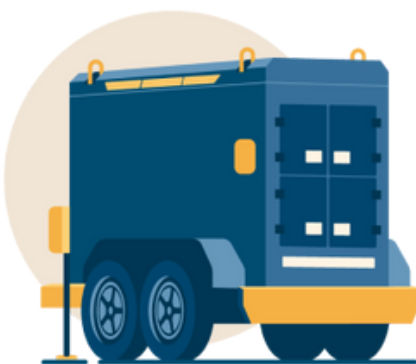
Mobile Power Units (MPUs)