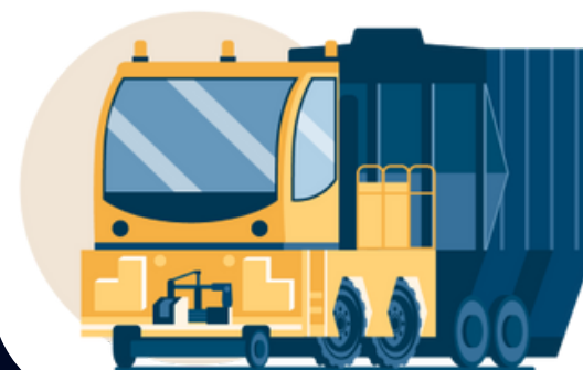
Railcar Movers and Freight Locomotives