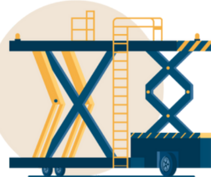
Airport Ground Support