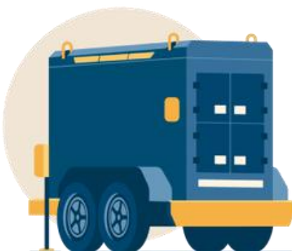
Mobile Power Units (MPUs)