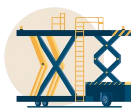
Airport Ground Support