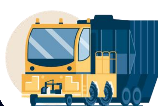
Railcar Movers and Freight Locomotives